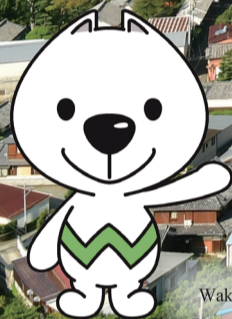
Wakayama Pref. advertising character 'Kii-Chan'

It's a region where the J-NIAHS certified "Arida citrus system that laid the foundation for citrus cultivation" and "Shimotsu stored citrus system" have been merged. We are aiming for GIAHS certification with this integrated system.