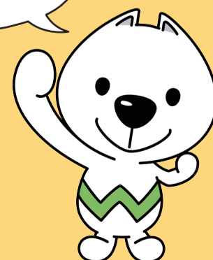
Wakayama Pref. advertising character 'Kii-Chan'

We will carry the traditional citrus system into the future!